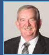
MAYOR DEREK CORRIGAN City of Burnaby

"We need to unite to protect the environment for all of our future generations. This is not just a First Nations issue. It's time to get busy developing energy alternatives. Tsleil-Waututh is developing businesses that will provide clean, renewable energy sources like wind power."