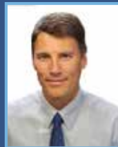
MAYOR GREGOR ROBERTSON City of Vancouver