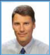
MAYOR GREGOR ROBERTSON City of Vancouver

"We must develop energy policies that focus on meeting North American energy requirements, not on profiting multi-national corporations at the expense of our environmental security. Risking an environmental disaster to provide energy supply for export is unacceptable policy and practice."