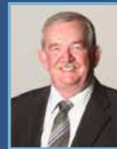
MAYOR DEREK CORRIGAN City of Burnaby